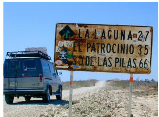
On the road to San Ignacio Lagoon

For the avid Baja traveler or those with a sense of adventure we offer a self-arrival program. Whether you arrive by automobile, bus, or private plane you'll enjoy the hospitality and comfort of our all-inclusive, secluded Ecolodge on the shores of San Ignacio lagoon - with all meals, beverages, kayaking, natural history excursions and two whale watches daily. Our "off the grid" solar and wind powered Eco-lodge offers all-inclusive amenities. Your days are spent whale watching and exploring, while evenings are spent in the company of our local lagoon resident staff in our eco-lodge discussing the day's events and enjoying informal lectures from our staff and resident experts.