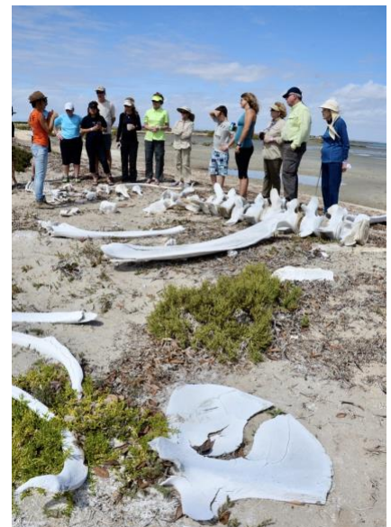
Group exploring the massive whale vertebrae in the Boneyard