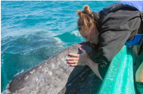
A special moment

Join us at Campo Cortez, our private Ecolodge along the shores of San Ignacio Lagoon where Gray Whales have migrated to for thousands of generations. This Gray Whale sanctuary is in the heart of Mexico's largest protected area, El Vizcaino Biosphere Reserve . Mother Gray Whales approach our boats and encourage us to scratch, pet and even sing to them and their newly born calves. Over the years, this has become a regular occurrence only at San Ignacio Lagoon. This truly unique location is the only Gray Whale birthing lagoon in the world that has been left untouched by man and has a local community striving to keep the lagoon a sacred and protected sanctuary for these