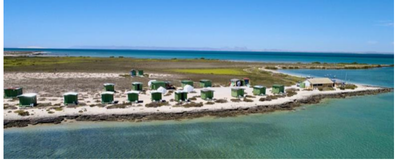
The Ecolodge at San Ignacio Lagoon – Campo Cortez

Our beachside cabins come equipped with electricity, comfortable beds and are well protected from the wind and elements. Twelve cabins are double occupancy with two single beds and three cabins are triple occupancy with a double bed on one side and a single bed opposite. All our cabins are supplied with fresh linens, pillows, shelves along with countertop space, small desk and mirrors. They are cozy, efficient and leave a small footprint on the land while keeping with local Biosphere Regulations.