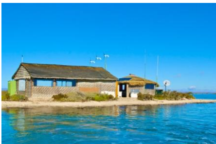
Dining Palapa at the Point

Seemingly perched on the edge of civilization Campo Cortez Ecolodge offers modern amenities that are clean, comfortable, and low impact on the environment. Campo Cortez is a completely off the grid solar and wind powered community. Constructed from local materials and by traditional building methods, our palapa is the gathering point for all our daily activities and meals. Powered by a modern solar and wind generation system, our electrical system provides 110 ac or 12-volt DC power for all your charging needs. You can charge your phone, video camera or camera batteries anytime in the dining palapa or your cabin during the day. Our facilities include hot showers, flushing marine toilets, and numerous hand washing stations.