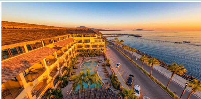
Hotel La Mision – Gateway to the Sea of Cortez

While in Loreto, enjoy the amenities of this first-class hotel. We will have a daily breakfast buffet in the hotel restaurant. You can unwind poolside and take a swim or admire the view from your room overlooking the Sea of Cortez and local islands. Perfectly located for easy strolls to dining, shopping and the beach front walking path.