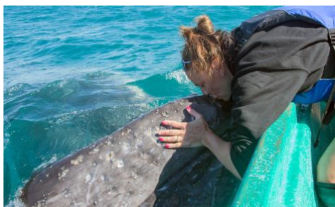
A special moment

The most comprehensive and extraordinary of whale watching adventures is our 8 day Big Whale Trip that begins in the small town of Loreto in Baja Sur., Mexico on the Sea of Cortez. On this 8 day journey, we visit the Gray Whale Sanctuary of San Ignacio Lagoon and our private Ecolodge "Campo Cortez" where mother Gray Whales approach our boats and encourage us to scratch, pet and even sing to them and their newly born calves. Over the years, this has become a regular occurrence only at San Ignacio Lagoon. After three full days at San Ignacio Lagoon, we return to the Sea of Cortez and Loreto which is the winter home to the largest of all whales, the Blue Whale along with a huge variety of other marine mammals