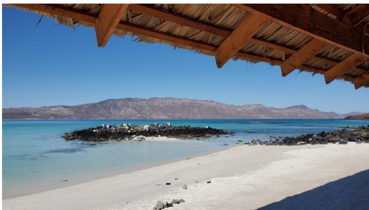
Explore a local island off the coast of Loreto

Upon returning to Loreto, we will get settled in at the hotel and you will enjoy a free evening to explore Loreto's many exquisite restaurants on your own or you can join the group for dinner. The next morning after breakfast at the hotel we walk across the street to load into our boats for the tour of Loreto National Marine Park . We will search for Blue Whales,