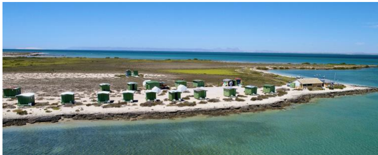
The Ecolodge at San Ignacio Lagoon – Campo Cortez

Our beachside cabins come equipped with electricity, comfortable beds and are well protected from the wind and elements. Twelve cabins are double occupancy with two single beds and three cabins are triple occupancy with a double bed on one side and a single bed opposite. All our cabins are supplied with fresh linens, pillows, shelves along with countertop space, small desk and mirrors. They are cozy, efficient and leave a small footprint on the land while keeping with local Biosphere Regulations.