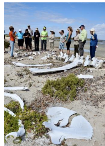
Group exploring the massive whale vertebrae in the Boneyard

We are consistently rated the #1 Travelers' Choice on Trip Advisor year after year for one reason, our Staff and Owners - who are residents and locals to San Ignacio Lagoon. We are four generations of family living and working in the lagoon since the settlement of San Ignacio Lagoon. We take pride in our efforts at our Eco-lodge to have a low-impact environmentally and the responsibility that we carry as Ambassadors to the lagoon and its many wildlife residents.