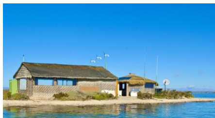
Dining Palapa at the Point

Seemingly perched on the edge of civilization Campo Cortez offers modern amenities that are clean, comfortable, and low impact on the environment. Campo Cortez is a completely off the grid solar and wind powered Eco-lodge. Constructed from local materials and by traditional building methods, our palapa is the gathering point for all our daily activities and meals. Powered by modern solar and wind generation system, our electrical system provides 110 ac or 12-volt dc power for all your charging needs. You can charge your phone, video, and camera batteries anytime in the dining palapa or your cabin anytime during the day. Our facilities include hot showers, flushing marine toilets, and numerous hand washing stations.