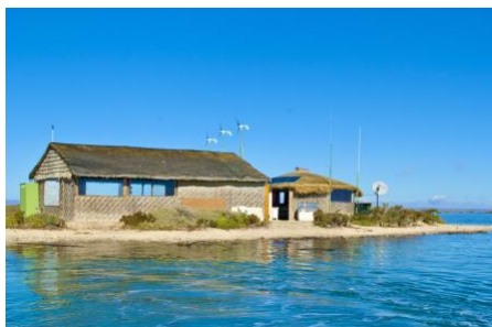
Dining Palapa at the Point

Seemingly perched on the edge of civilization Campo Cortez Ecolodge offers modern amenities that are clean, comfortable, and low impact on the environment. Campo Cortez is a completely off the grid solar and wind powered community. Constructed from local materials and by traditional building methods, our palapa is the gathering point for all our daily activities and meals. Powered by a modern solar and wind generation system, our electrical system provides 110 ac or 12-volt DC power for all your charging needs. You can charge your phone, video camera or camera batteries anytime in the dining palapa or your cabin during the day. Our facilities include hot showers, flushing marine toilets, and numerous hand washing stations.