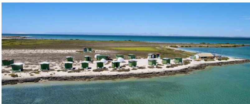
The Ecolodge at San Ignacio Lagoon – Campo Cortez

Our beachside cabins come equipped with electricity, comfortable beds and are well protected from the wind and elements. Twelve cabins are double occupancy with two single beds and three cabins are triple occupancy with a double bed on one side and a single bed opposite. All our cabins are supplied with fresh linens, pillows, shelves along with countertop space, small desk and mirrors. They are cozy, efficient and leave a small footprint on the land while keeping with local Biosphere Regulations.