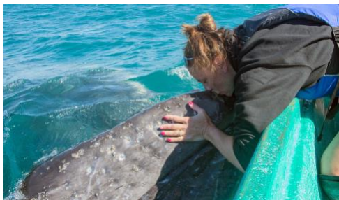
A special moment

Join us at Campo Cortez, our private Ecolodge along the shores of San Ignacio Lagoon where Gray Whales have migrated to for thousands of generations. This Gray Whale sanctuary is in the heart of Mexico's largest protected area, El Vizcaino Biosphere Reserve . Mother Gray Whales approach our boats and encourage us to scratch, pet and even sing to them and their newly born calves. Over the years, this has become a regular occurrence only at San Ignacio Lagoon. This truly unique location is the only Gray Whale birthing lagoon in the world that has been left untouched by man and has a local community striving to