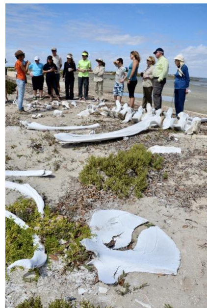
Group exploring the massive whale vertebrae in the Boneyard