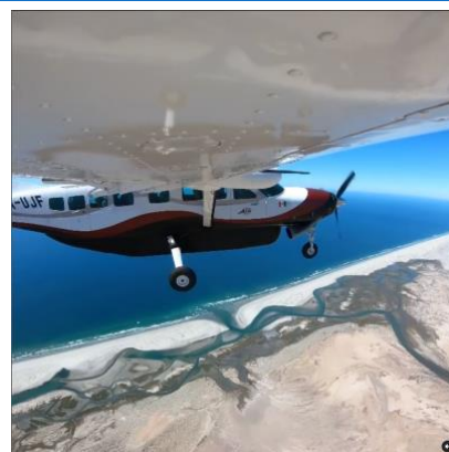
Spectacular views of Baja

A great way to see the Baja landscape scenery from the air on this 2.5 hour flight via our commercially chartered aircraft. Our trip begins in San Diego and our experienced guides escort you to your flight. You'll spend four days and four nights at our Ecolodge in simple and comfortable solar powered cabins with views of the lagoon, comfortable beds, and electricity to charge your camera batteries or other small devices. Enjoy whale watching twice daily with our local guides and boat captains who are residents of the lagoon that share with you their local knowledge of this peaceful Gray Whale Sanctuary. Days are spent whale watching, beachcombing, and guided kayaking and tidepool walks while evenings are spent discussing the day's events with informal lectures and discussions. Enjoy delicious authentic meals made with fresh locally sourced ingredients and you'll love the sunsets, sunrises, and star gazing at night.